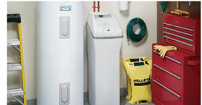
Household Soft Water