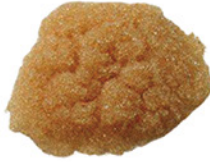
Imported Polishing Resin