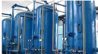
Boiler Softening Water