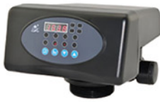
Full-Automatic Softening Valve